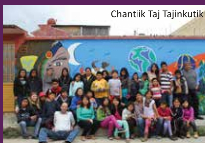
Chantiik Taj Tajinkutik