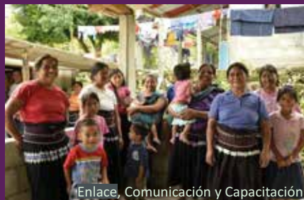
Enlace, Comunicación y Capacitación