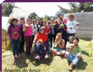
Ángeles de Amor

AMIGOS CONTRIBUTION TO THE PROJECT: Building material for a fungi module and expenses of three training workshops.