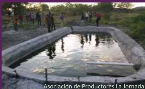
Asociación de Productores La Jornada