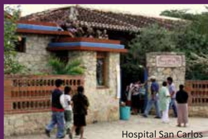
Hospital San Carlos

AMIGOS CONTRIBUTION TO THE PROJECT: Building material for poultry and vegetables, purchase of tools and seeds.