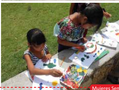
Mujeres Sembrando la Vida