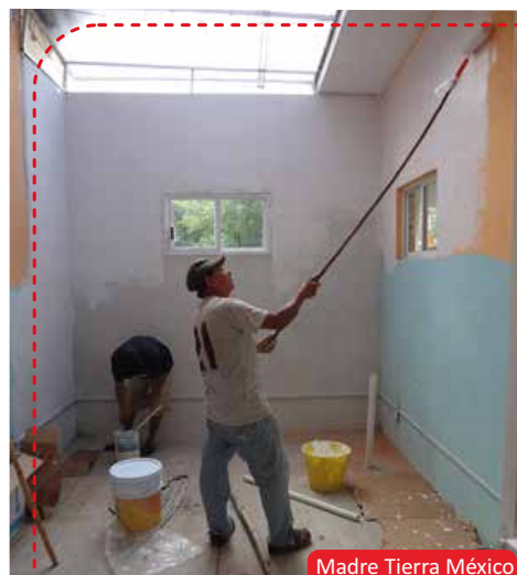
Madre Tierra México