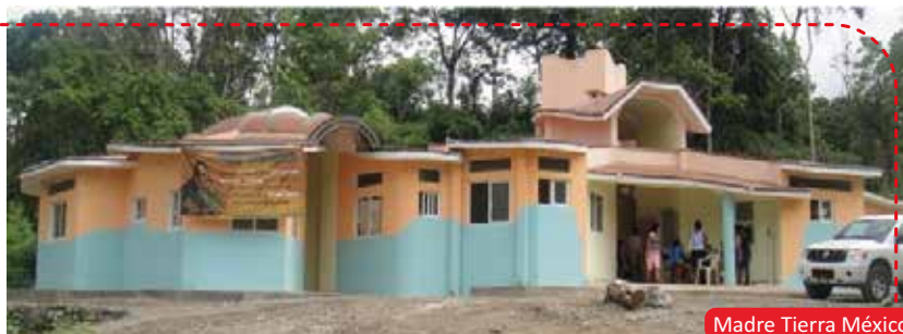
Madre Tierra México