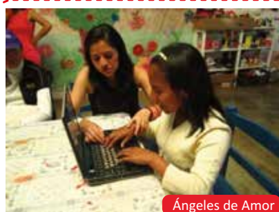
Ángeles de Amor