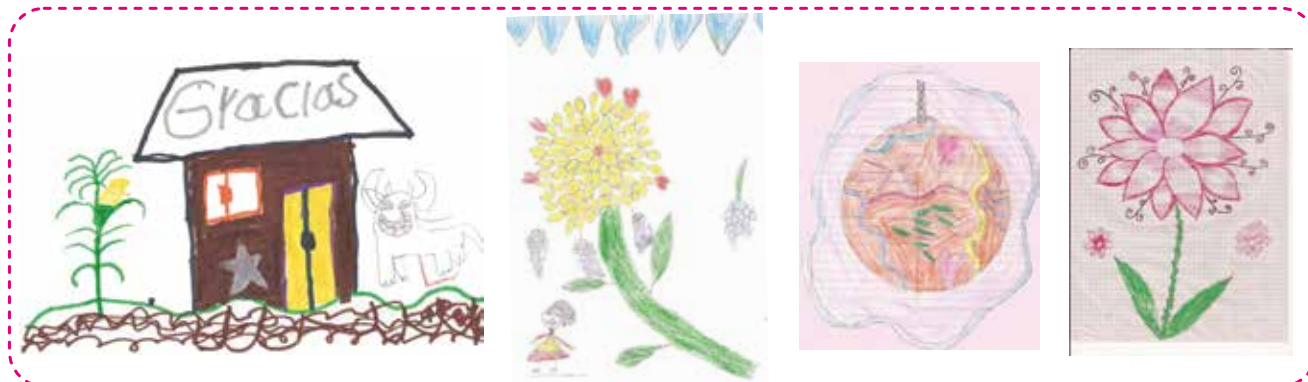
Some drawings made by children