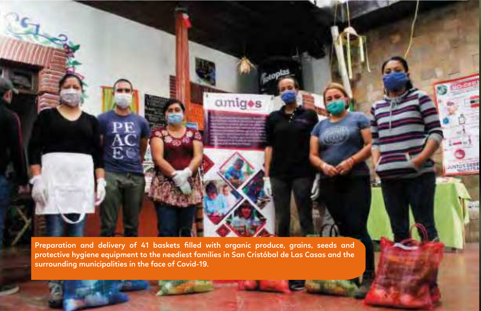
Preparation and delivery of 41 baskets filled with organic produce, grains, seeds and protective hygiene equipment to the neediest families in San Cristóbal de Las Casas and the surrounding municipalities in the face of Covid-19.