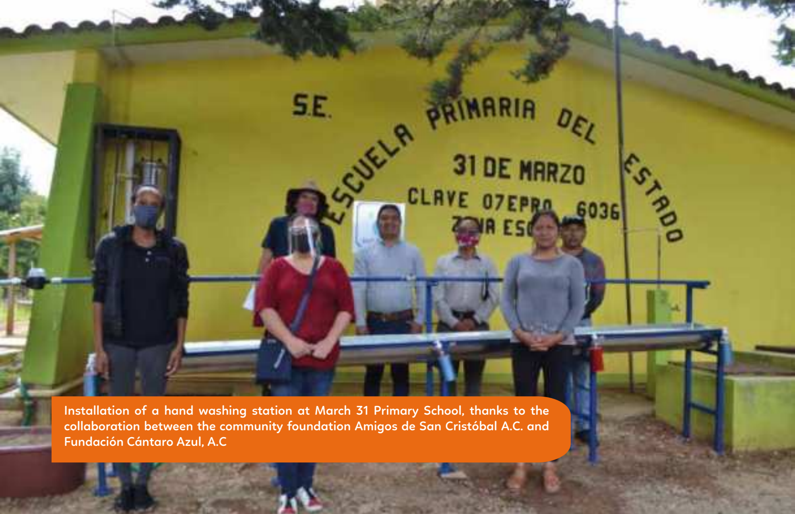
Installation of a hand washing station at March 31 Primary School, thanks to the collaboration between the community foundation Amigos de San Cristóbal A.C. and Fundación Cántaro Azul, A.C